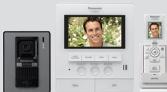
Door Station x 1, Main Monitor x 1, Wireless Sub Monitor x 1