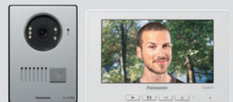
Door Station x 1, Monitor x 1