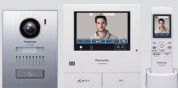
Door Station x 1, Main Monitor x 1, Wireless Sub Monitor x 1